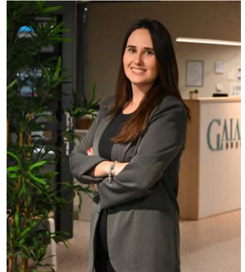
Academic Programs Specialist