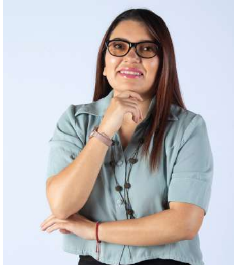
GAIAS Europa team - Quito