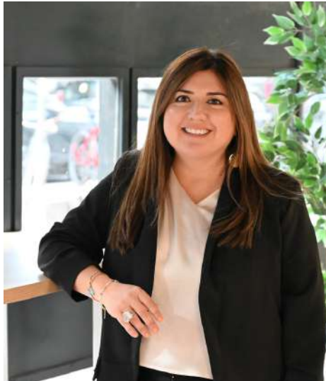
Academic and Student Services Director