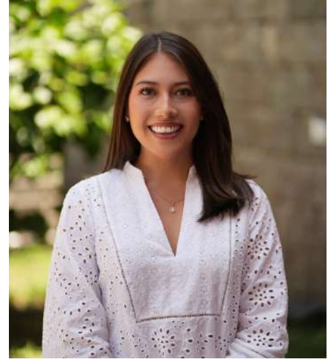
GAIAS Europa team - Quito