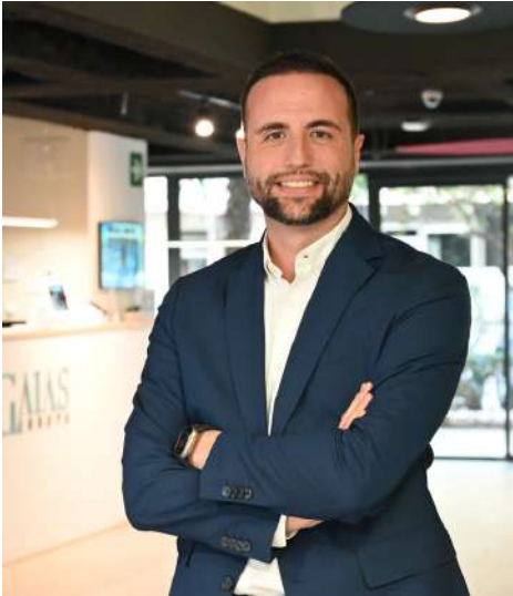
GAIAS Europa Director