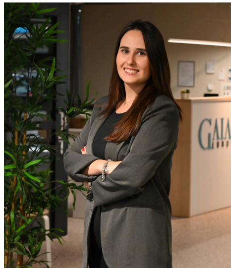
Academic programs Specialist