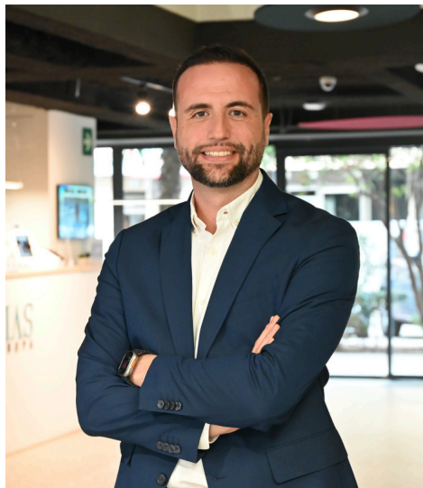
GAIAS Europa Director