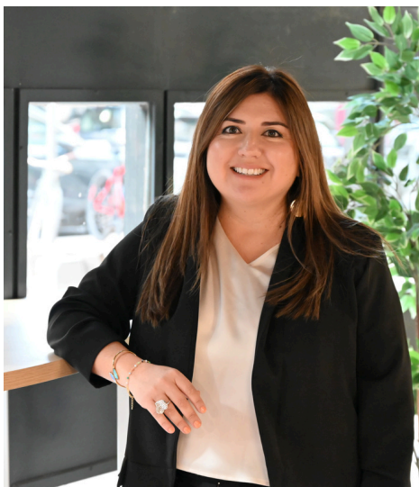
Director of Academic and Student Services