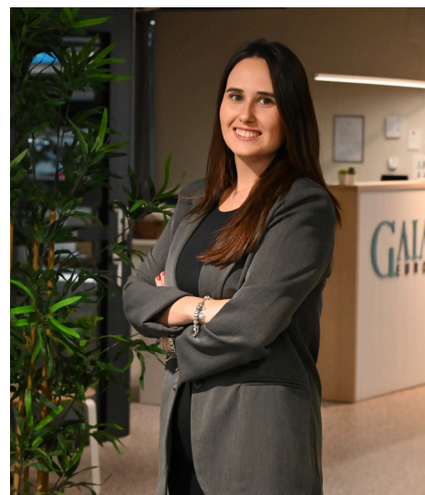
Academic Programs Specialist