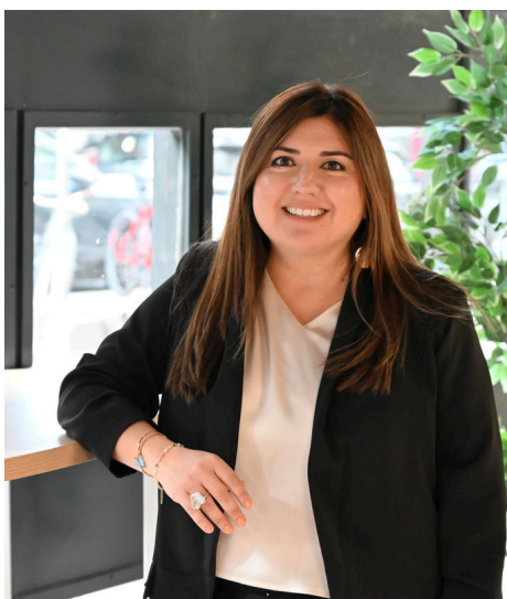
Academic and Student Services Director