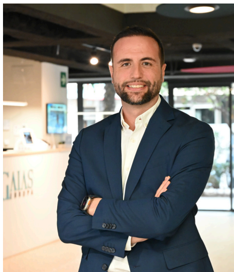
GAIAS Europa Director