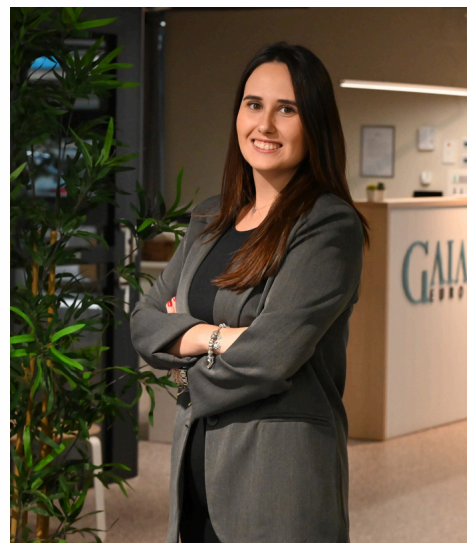
Academic programs Specialist