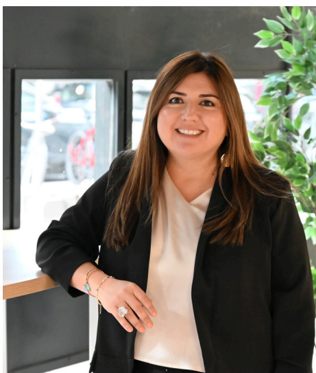
Director of Academic and Student Services