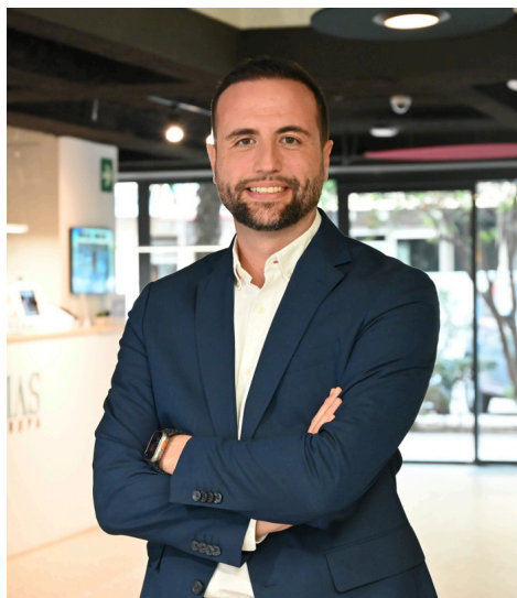
GAIAS Europa Director