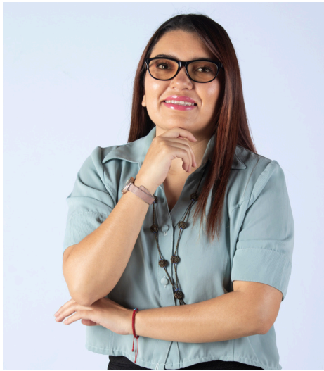
GAIAS Europa team - Quito