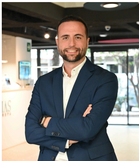
GAIAS Europa Director