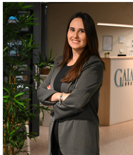
Academic programs Specialist