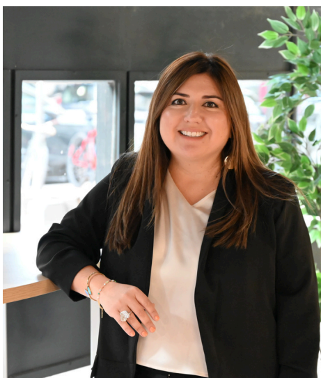
Director of Academic and Student Services