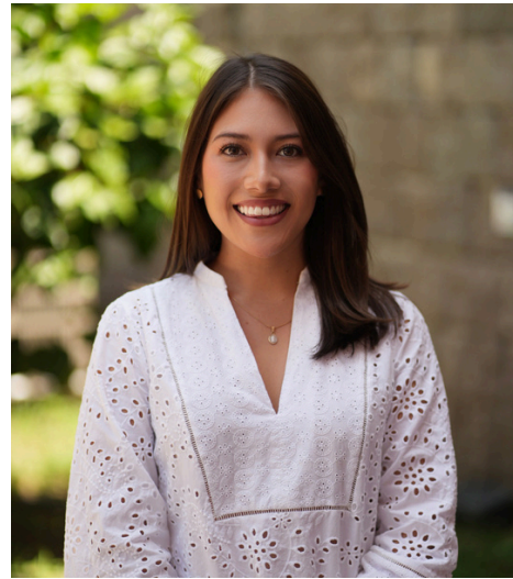
GAIAS Europa team - Quito