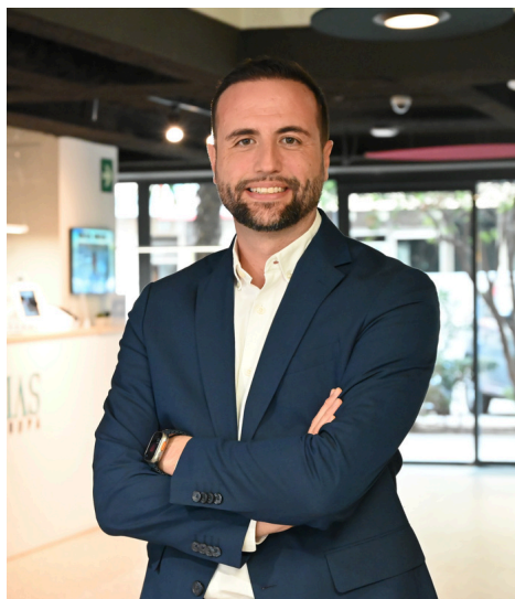
GAIAS Europa Director