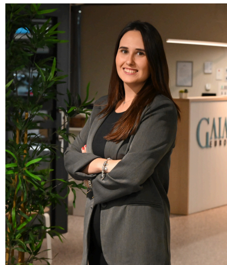
Academic programs Specialist