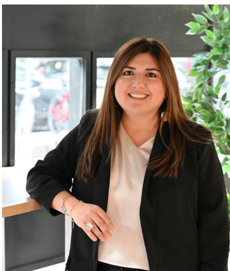
Director of Academic and Student Services