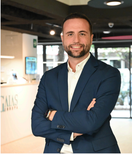
GAIAS Europa Director