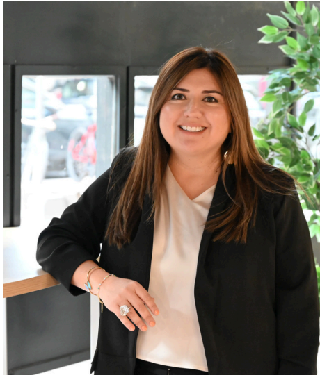
Academic and Student Services Director