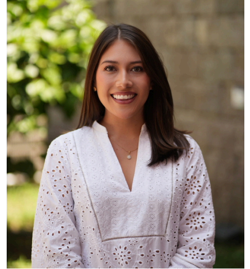
GAIAS Europa team - Quito