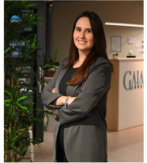
Academic Programs Specialist