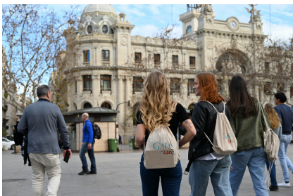
Valencia City Tour