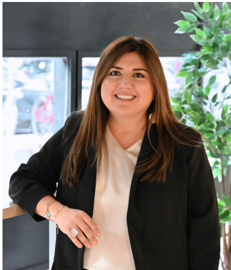
Academic and Student Services Director