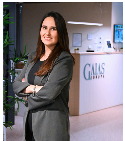
Academic Programs Specialist