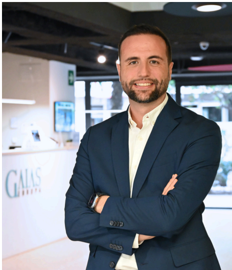
GAIAS Europa Director